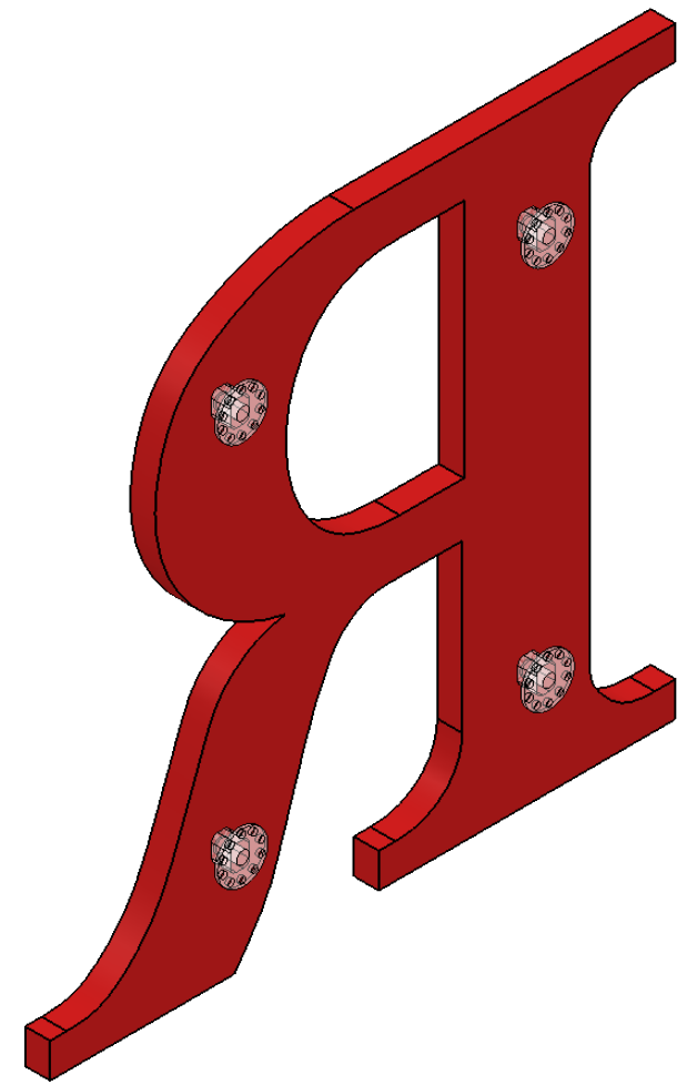
ISOMETRIC BACK VIEW II SCALE 1:3