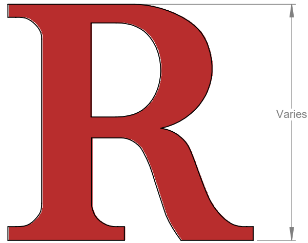
FRONT VIEW II SCALE 1:5

Radius varies based on size (0.015" - 0.135")